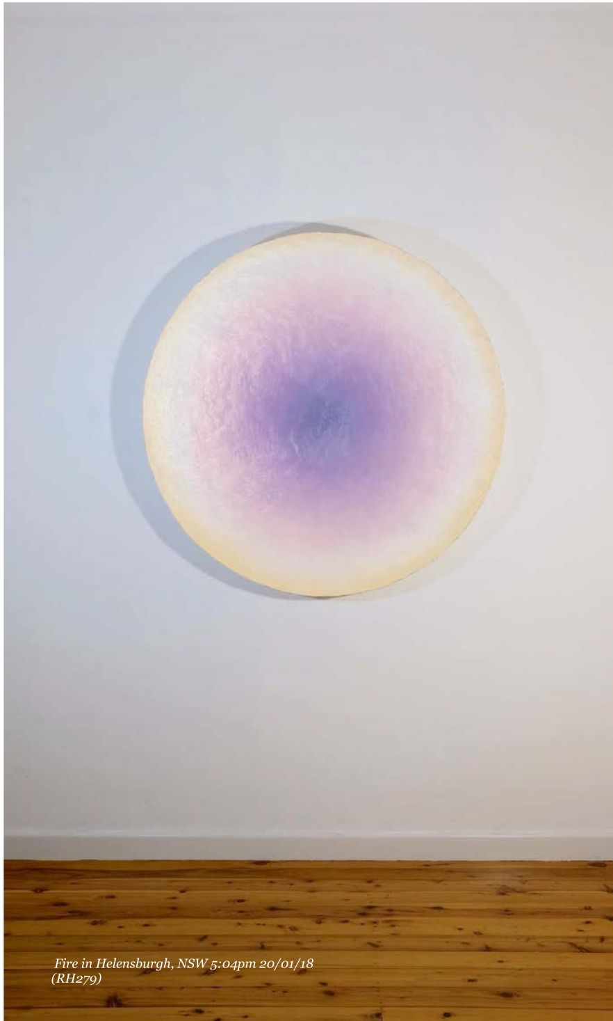
Fire in Helensburgh, NSW 5:04pm 20/01/18 (RH279)