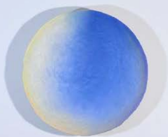
Ridgetop Campground, Berowra 7:43pm 07/02/18 (RH295)