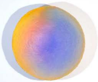
Murdering Gully, Glenrock State Conservation Area 6:33am 19/02/18 (RH302)