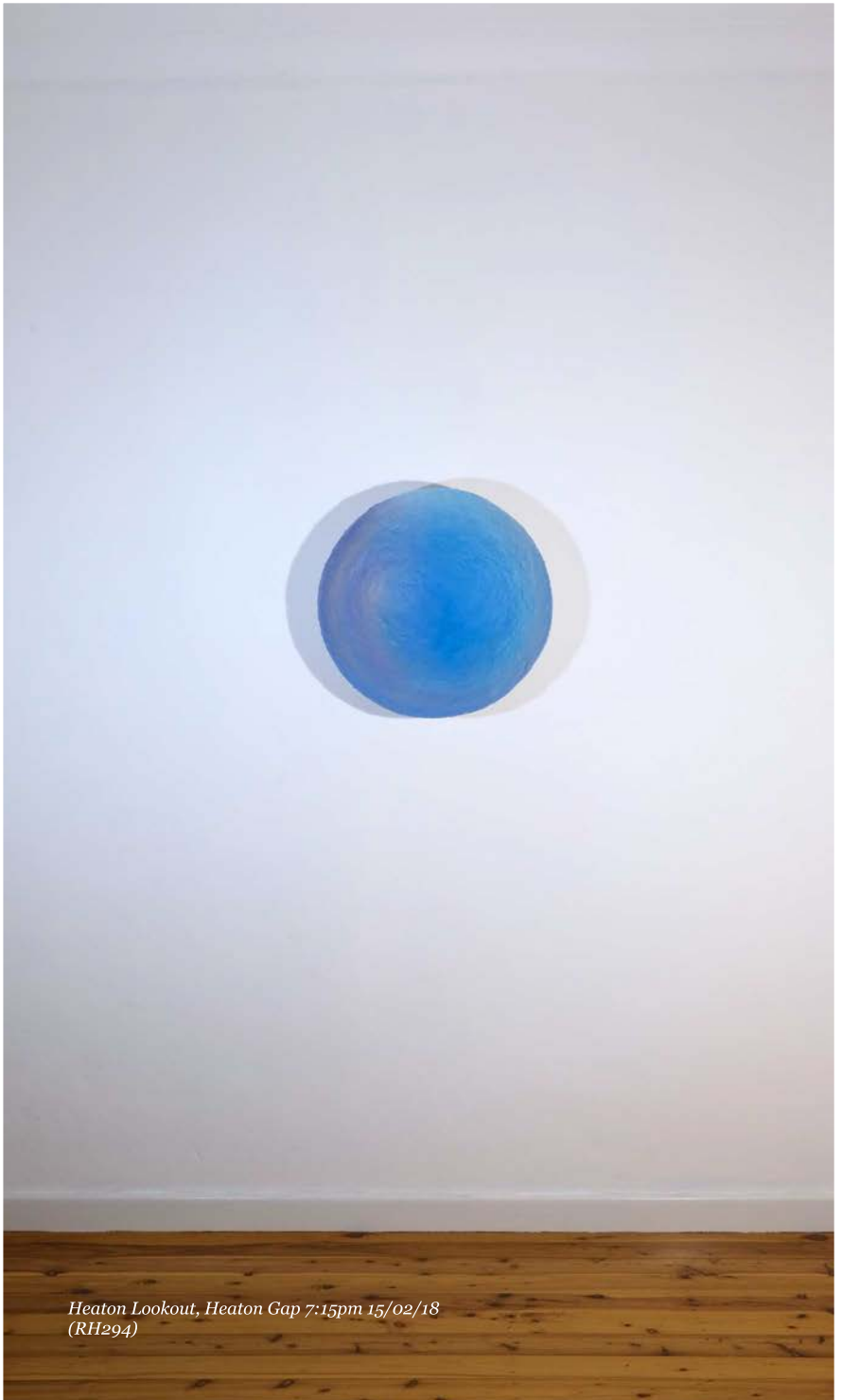
Heaton Lookout, Heaton Gap 7:15pm 15/02/18 (RH294)