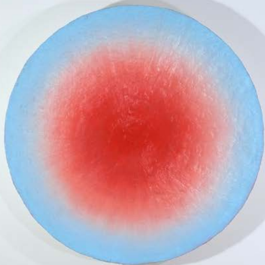
Heaton Lookout, Heaton Gap 5:54am 16/02/18 (RH287)