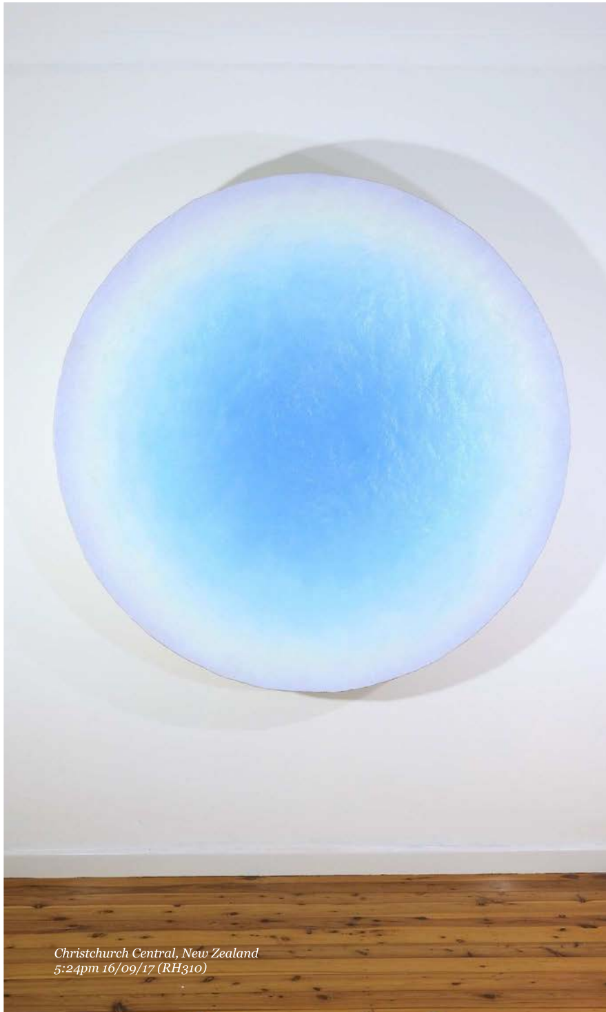
Christchurch Central, New Zealand 5:24pm 16/09/17 (RH310)