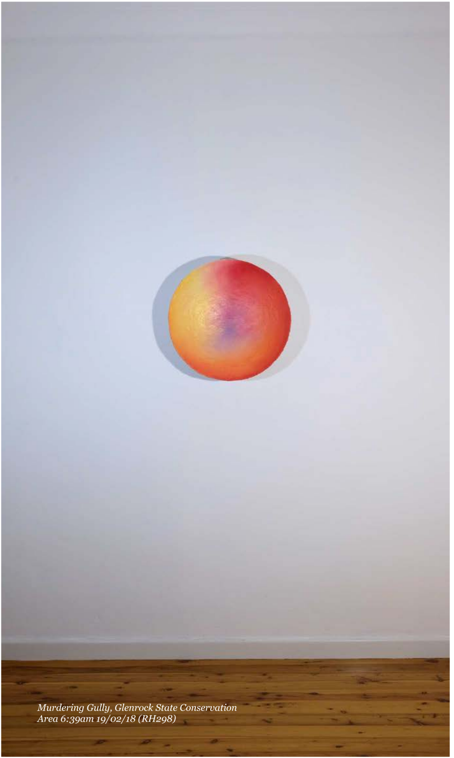
Murdering Gully, Glenrock State Conservation Area 6:39am 19/02/18 (RH298)