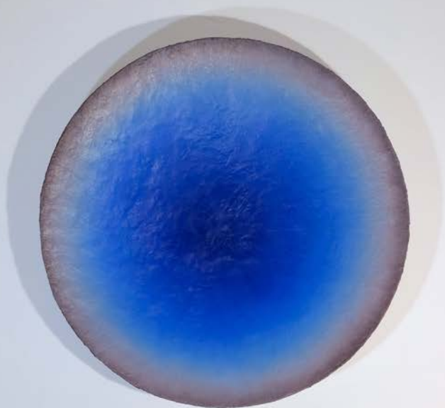
River Derwent, Tasmania 6:06am 03/03/18 (RH290)