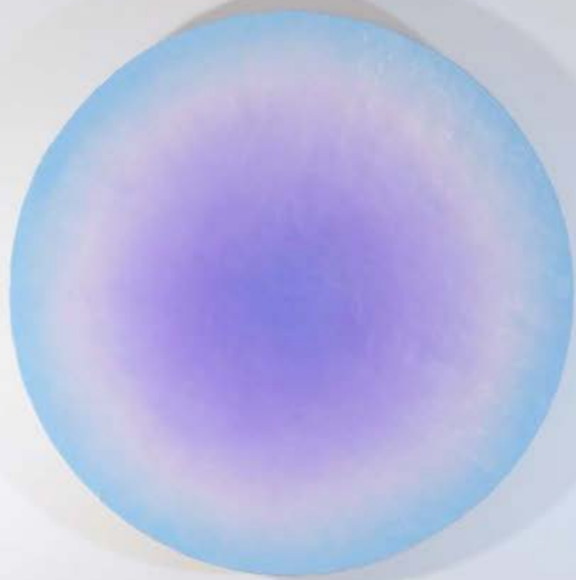
Crossing the Harbour Bridge looking east, Sydney 4:40pm 05/04/18 (RH278)