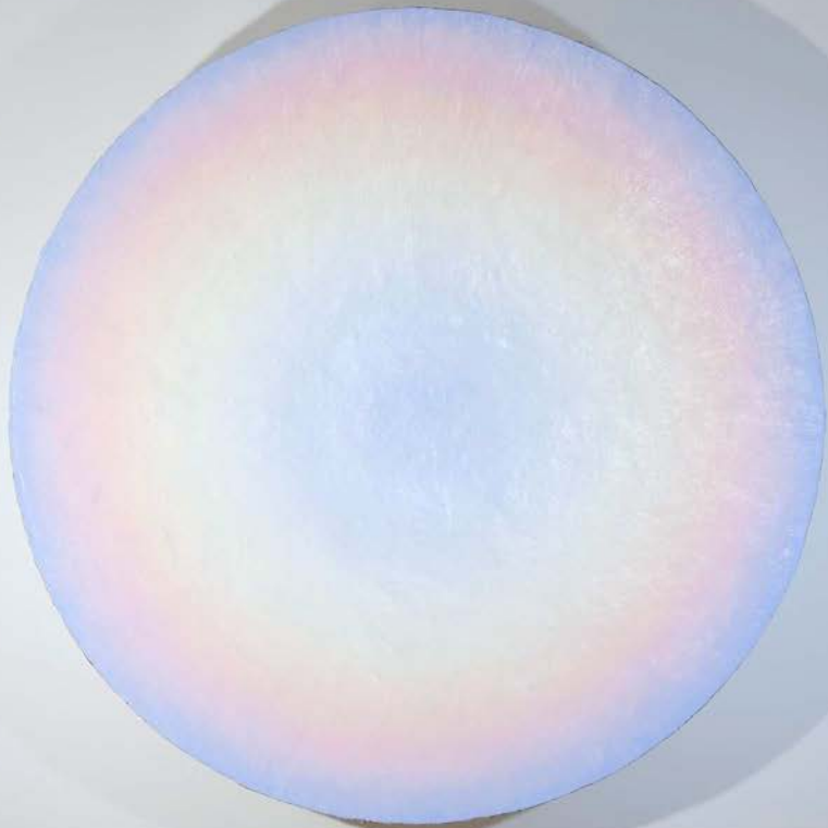
Lake Lyell fire trail, Rydal 5:26pm 14/04/18 (RH309)