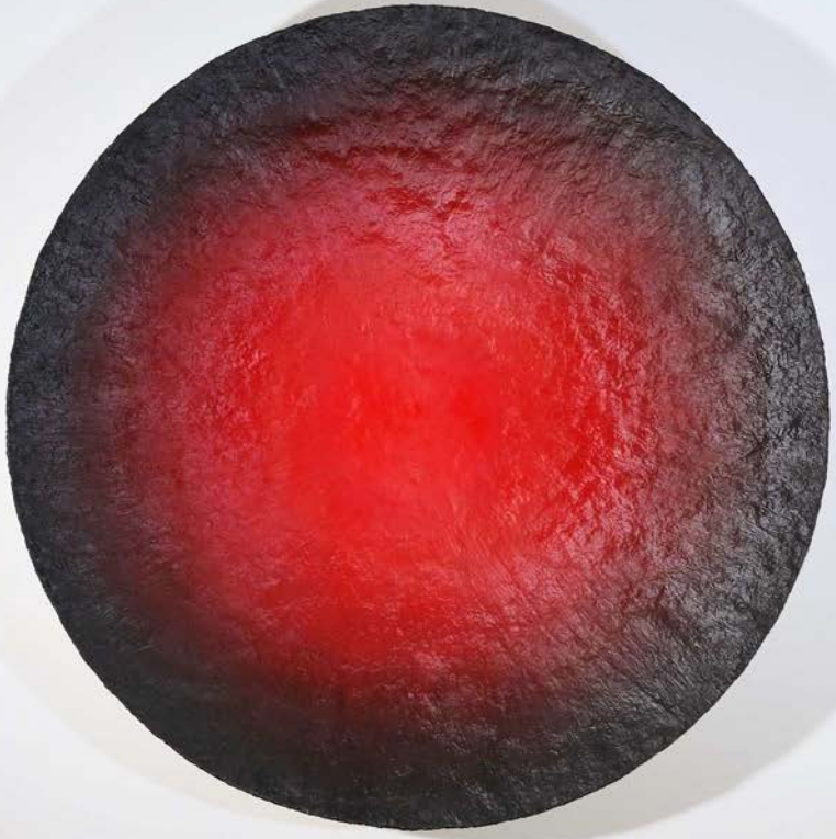
Murdering Gully, Glenrock State Conservation Area 6:28pm 19/02/18 (RH311)