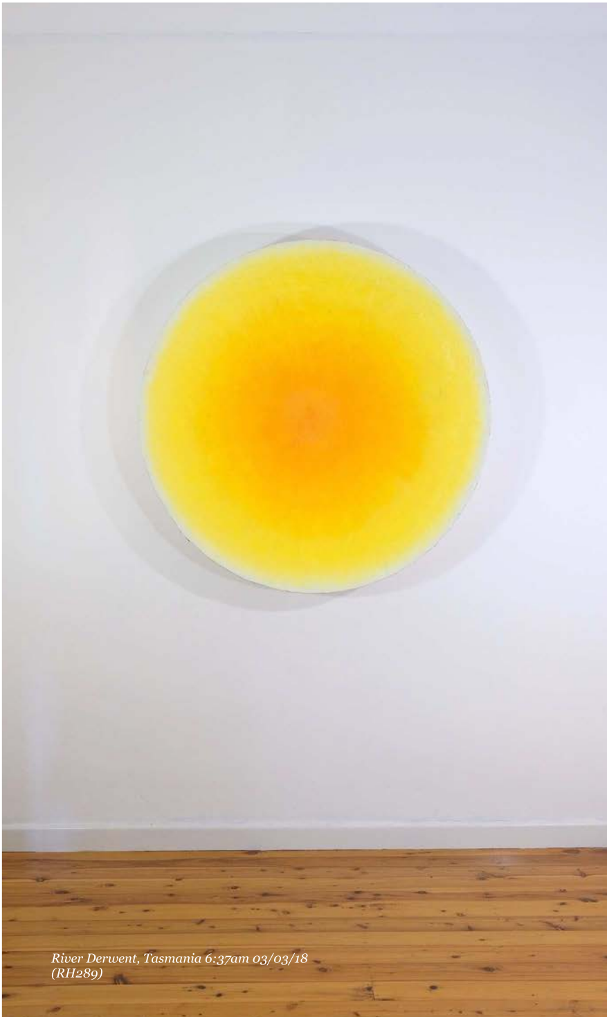
River Derwent, Tasmania 6:37am 03/03/18 (RH289)