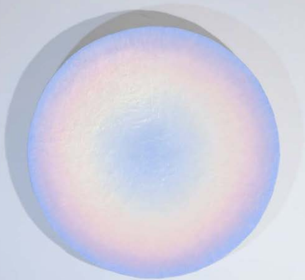
Lake Lyell fire trail, Rydal 5:26pm 14/04/18 (RH291)