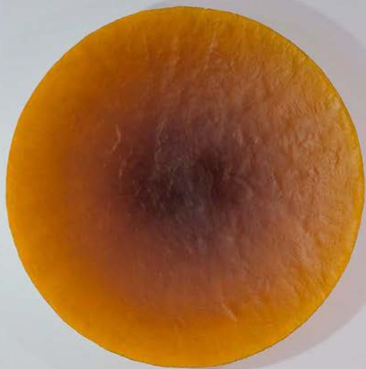
Leaving Christchurch, New Zealand 6:30am 17/09/17 (RH281)